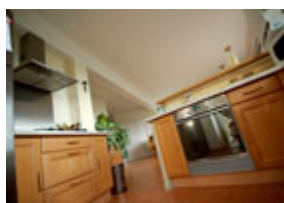
Kitchen & bathrooms